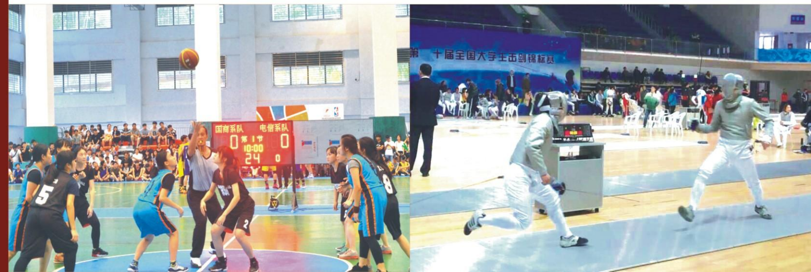
▼ 我院学生击剑队参加全国大学生击剑锦标赛 Students of SIT took part in National College Fencing Championships