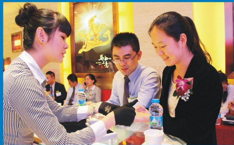
珠宝营销 Jewelry Marketing