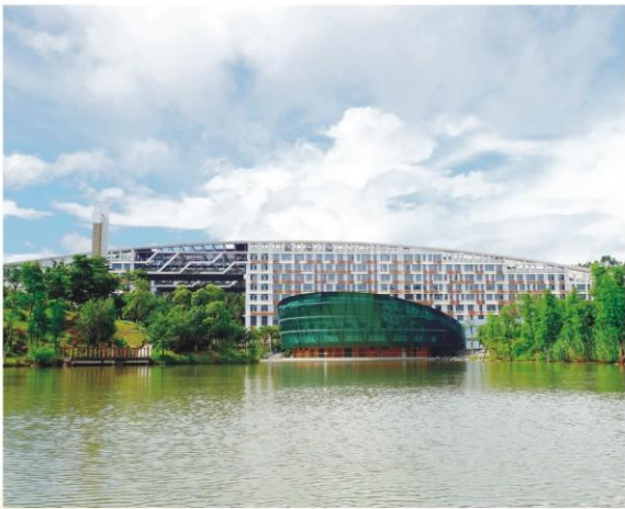
教学楼 Teaching Building