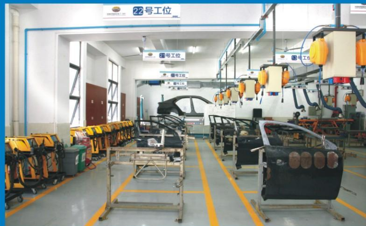
汽车维修专业实训室 Automobile Repair Workshop