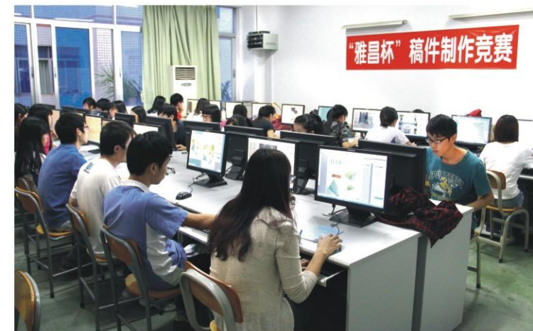
印刷稿件制作 Article Printing

School of Graphic Communication Technology provides the following programs: Graphic Information Processing, and Printing Technology.