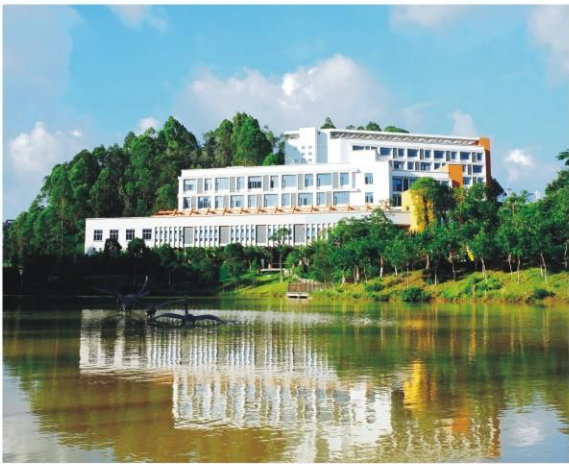
行政楼 Administrative Building