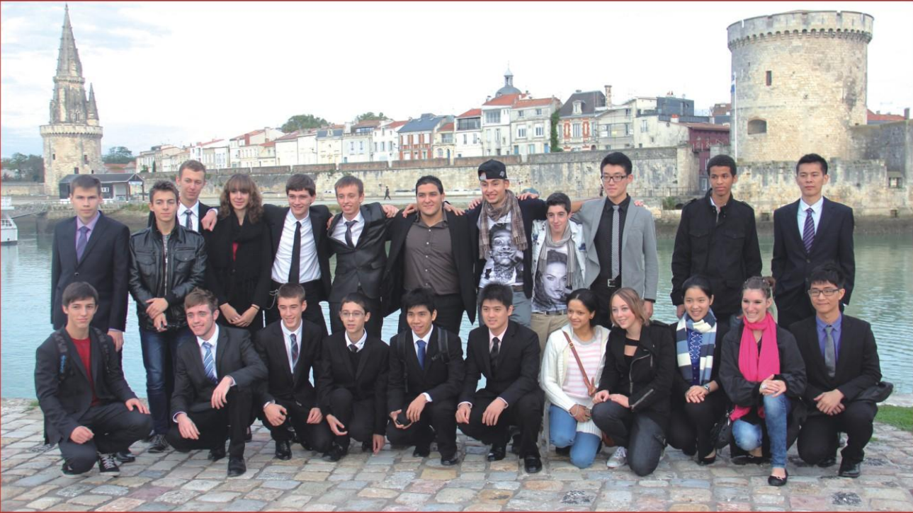
学院学生赴法国竞赛交流与法国学生合影 Students exchange and competition in France