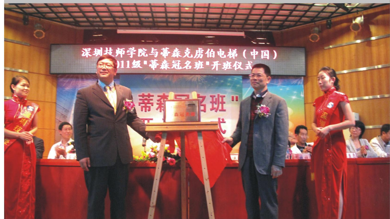
学院与德国蒂森克努伯公司签约合作办学 Cooperation with ThyssenKrupp