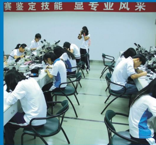
珠宝技能鉴定 Jewelry Identification

School of Jewelry provides the following programs: Jewelry Identification and Marketing, and Jewelry Design and Making.