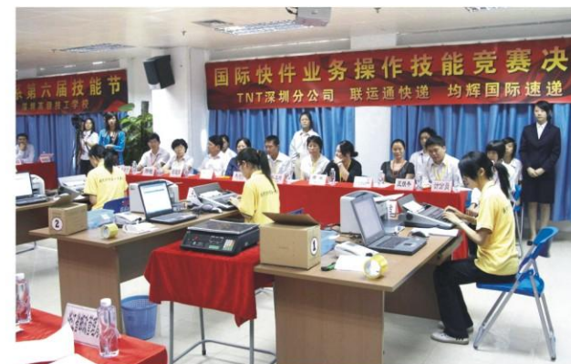
国际快件业务操作 International Express