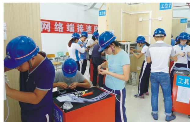
网络布线课程教学 Network Cabling

School of Electronic Information Technology provides the following programs: Communication Network Application, Intelligent Electronic Technology, and Internet Technology.