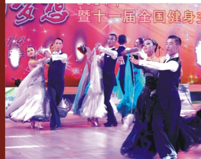
▲ 我院国标舞蹈队参加2016年全国健身交谊舞锦标赛，获多项一等奖 Students won the First Prize in National Ballroom Dancing Competition 2016.