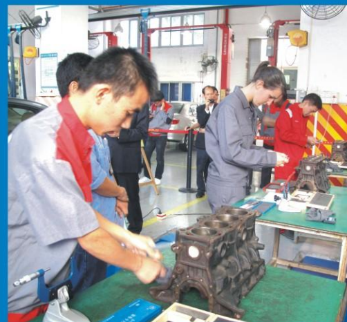
中法学子比试汽车维修技能 Automobile Repair Competition between Chinese and French students

School of Automobile Technology provides the following programs: Automobile Repair, Automotive Sheet Metal and Coating.