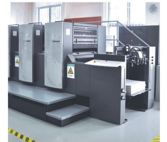
印刷专业实训室 Printing Workshop