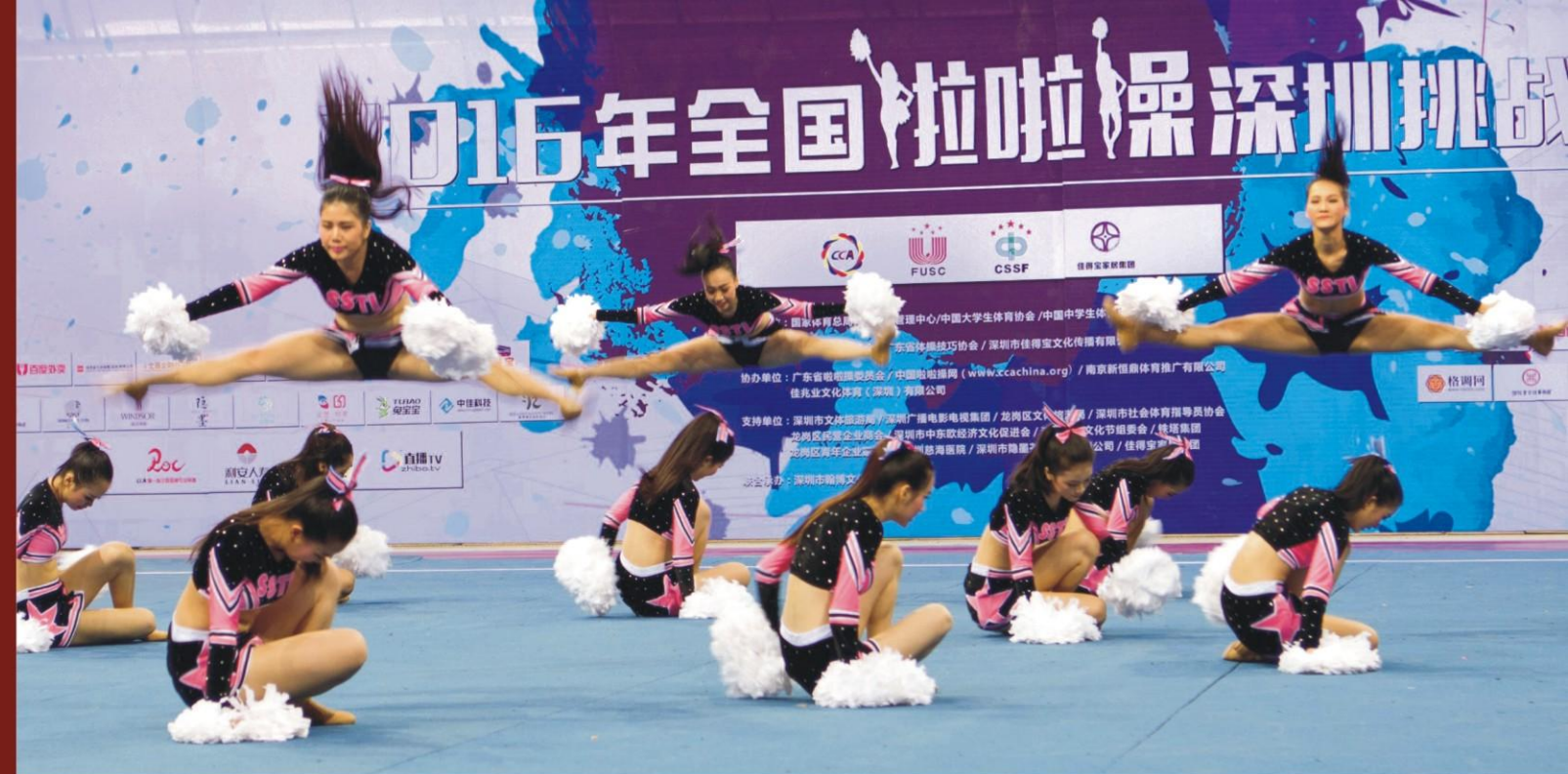
▲ 学院学生参加2016年全国啦啦操大赛荣获一等奖，将代表中国参加2016-2017年国际啦啦操大赛 Students won the First Prize in National Cheerleading Competition 2016, and will on behalf of China join in International Cheerleading Competition.