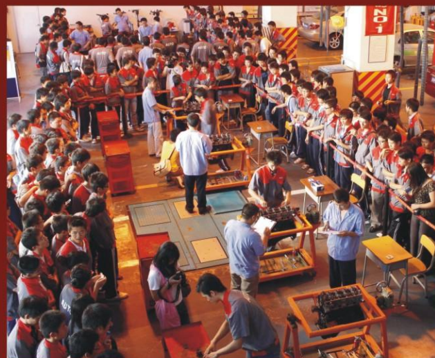
技能节开展汽车维修技能竞赛 Automobile Repair Competition in Festival of Skills