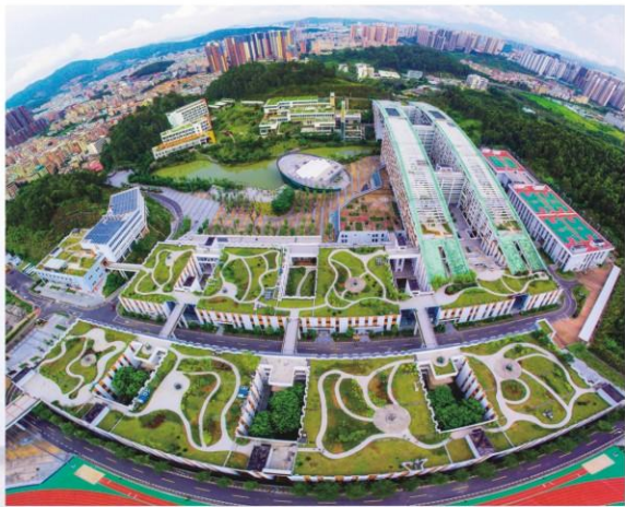
校园全景 Campus Landscape

深圳技师学院紧紧围绕为深圳产业转型升级和经济社会发展培养高技能人才这一中心任务，大力开展校企合作与国际合作，弘扬精益求精的工匠精神，不断推进教育教学改革，努力创建国内一流、国际知名的技师学院。经过30多年的探索和实践，学院逐步形成了自身的办学特色，取得了显著的办学成绩和各类荣誉，先后荣获“国家技能人才培养突出贡献奖”、“全国德育工作先进单位”、“国家高技能人才培养示范基地”、“世界技能大赛中国集训基地”、“广东省职业技术教育工作先进集体”等荣誉称号。2015年，学院马伟欣同学参加第43届世界技能大赛并荣获优胜奖。