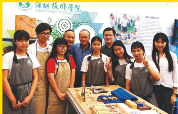
产品创新设计与制造创客实践室 Product Creative Design and Maker Workshop