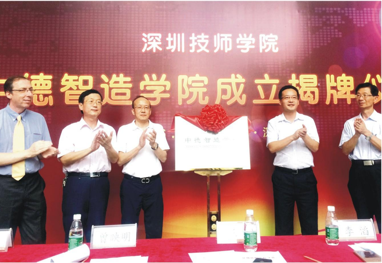
中德智造学院成立揭牌仪式 Opening Ceremony of Sino-Germany Intelligent Production School

学院注重国际交流与合作，学习借鉴发达国家的先进职业教育理念和高技能人才培养模式。与德国客尼集团合作成立中德智造学院，与法国、英国、澳大利亚等国家的职业院校签署了合作协议，开展师生互访、技能竞赛、师资培训、学术交流等活动。 SIT emphasizes the importance of international cooperation and exchanges, to learn the advanced vocational education concepts and training modes of high-skilled talents. We have founded the Sino-Germany Intelligent Production School with German Christani Group. We have signed the agreements with various vocational schools from France, UK and Australia, with frequent teacher-student exchanges, skill competitions, teacher training, and academic exchanges.