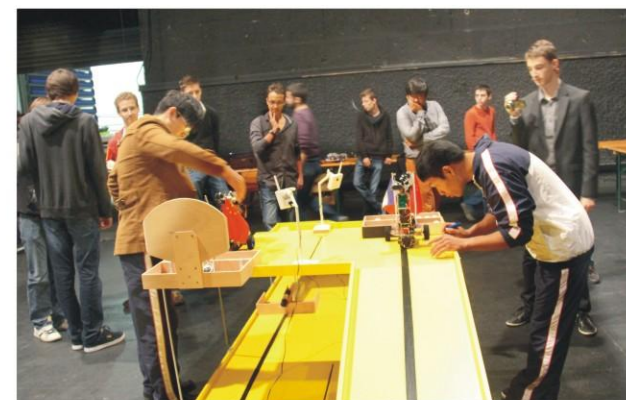
中法学生开展智能机器人竞赛 Robot Competition between Chinese and French Students