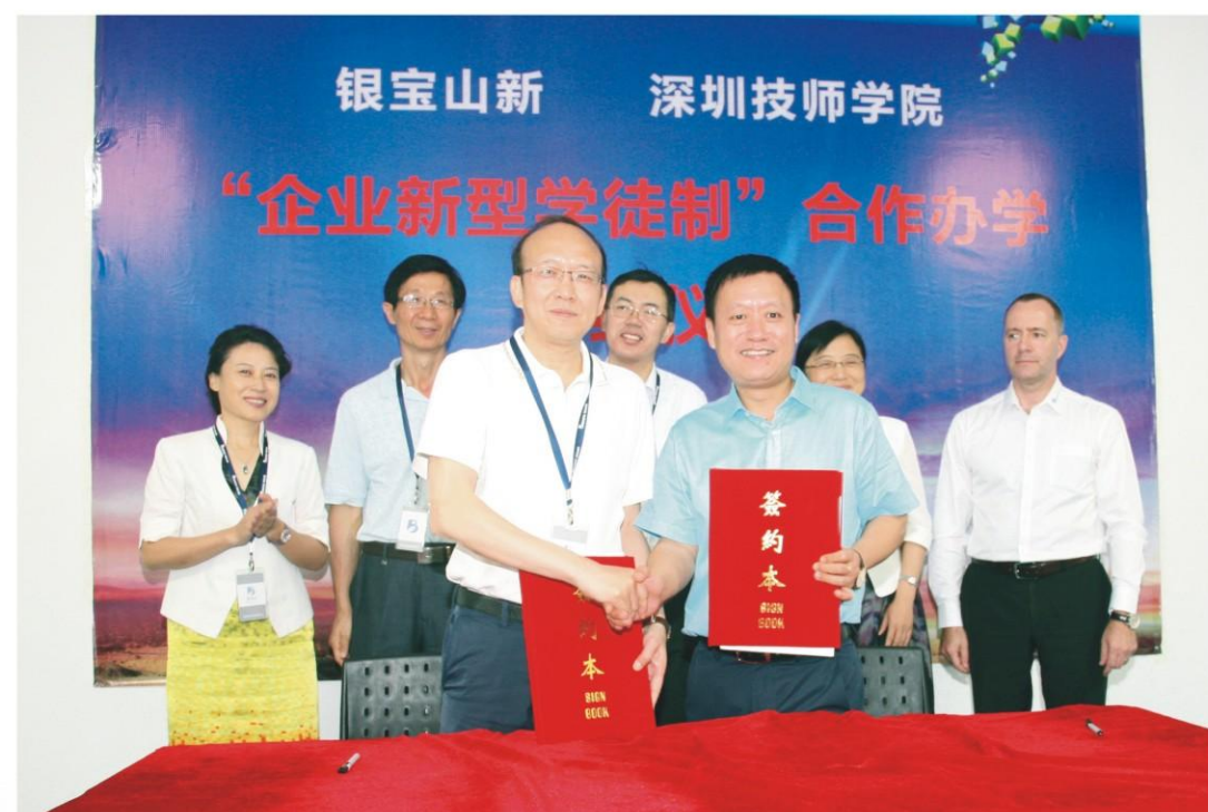
学院与深圳市银宝山新科技股份有限公司签约合作共同探索“企业新型学徒制”培养模式 Cooperation Agreement Signing Ceremony with Shenzhen Silver Basis to explore the talents cultivating mode of Modern Enterprise Apprenticeship

SIT established the basic system of school-enterprise cooperation in vocational education. Through the deep cooperation with Global 500 and leading enterprises, such as Toyota, Otis, ThyssenKrupp, IBM, we explore the new talent-cultivating mode of Modern Enterprise Apprenticeship Mode and cultivate the high-skilled talents according to the needs from enterprises.