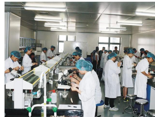
食品卫生检测 Food Inspection

School of Applied Biology provides the following program: Applied Biology Technology.