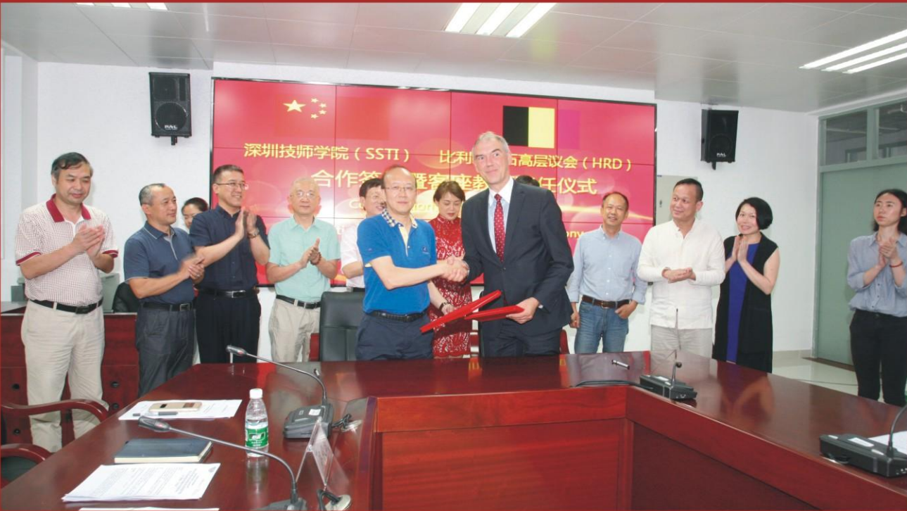
学院与比利时钻石高层议会签订合作办学框架协议 Framework Agreement with Belgium Diamond High Council