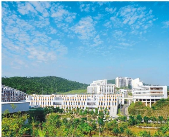
实训楼、宿舍楼 Workshop and Dormitory