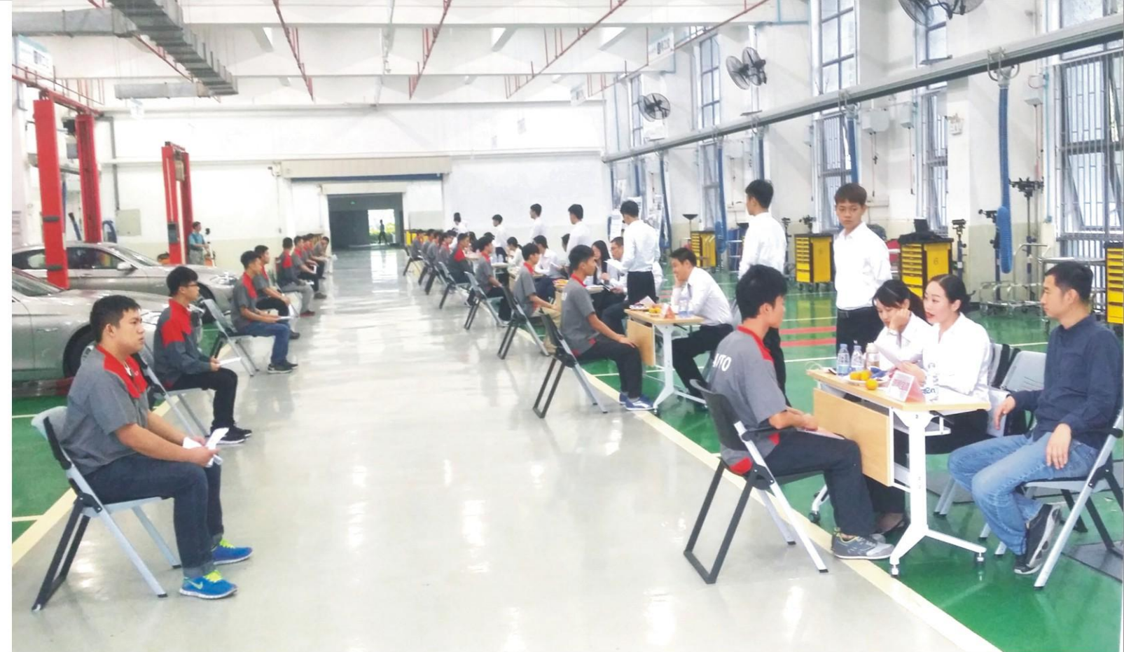
宝马汽车公司来学院招聘毕业生 BMW Campus Recruitment